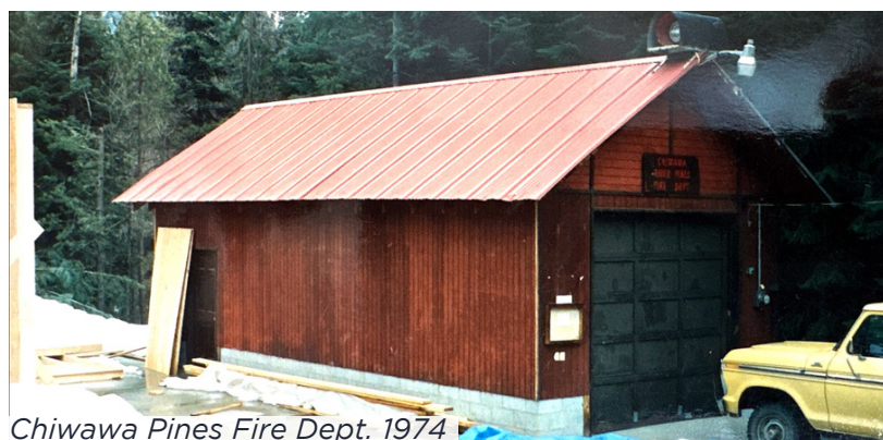
Chiwawa Pines Fire Dept. 1974