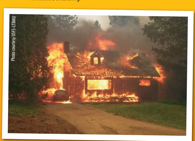
This house was ignited by burning embers landing on vulnerable spots. Notice the adjacent forest is not burning.

Maintain wooden fences in good condition and create a noncombustible fence section or gate next to the house for at least five feet.